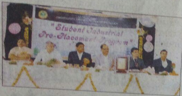
Guests present at the workshop.

A DAYLONG workshop on "Students Industrial Pre-Placement Programme" was organised by Chhatrapati Shivaji College of Pharmacy, Deori in association with MSBTE, Mumbai and Pristyn Research Solution, Pune. The