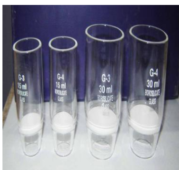
Fig. Glass crucibles