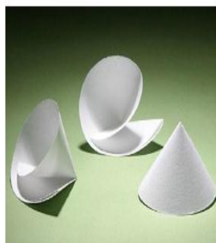
Fig. Filter papers