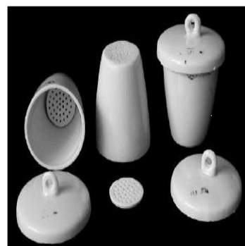
Fig. Gooch crucibles